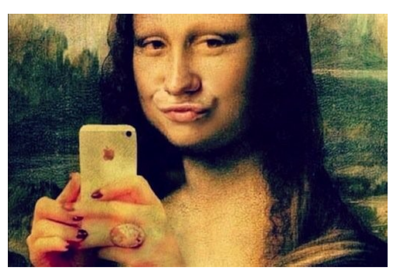
Our Modern Mona Lisa

But not to worry, as we mentioned in our previous P&F meeting a couple of weeks ago; our children and adolescents are growing by the day. Parents have laid the foundation for their children and the children will build upon this foundation. They may make mistakes, but it's ok; they can demolish, renovate and rebuild again – in the same way people build, demolish and renovate their houses.