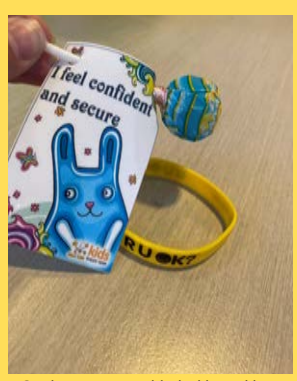
Student were provided with positive