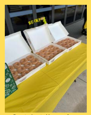
Donuts donated by one of our supporting families