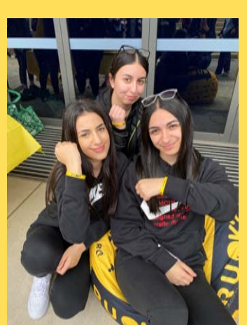
Our wonderful students supporting R U OK? Day