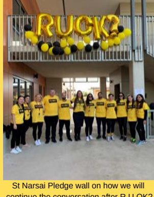
continue the conversation after R U OK?