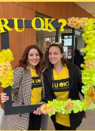
Our school counsellor and Pastoral Care Coordinator supporting R U OK? day