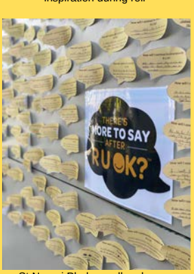
St Narsai Pledge wall on how we will continue the conversation after R U OK?