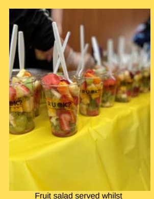
students arrived to school