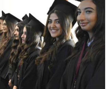
A LOOK AT WHAT'S INSIDE THE ISSUE:

You may be aware through recent media reports that there has been a disproportionate increase in the number of Australian students or teens that are suffering from anxiety, depression and panic attacks or panic disorders in 2020. Unfortunately, we too are seeing a growth in the number of students facing various difficulties and are working hard through our processes and procedures with respective parents to support all these students. Please visit the link below for more detailed advice relating to teenagers health and wellbeing: https://raisingchildren.net.au/teens