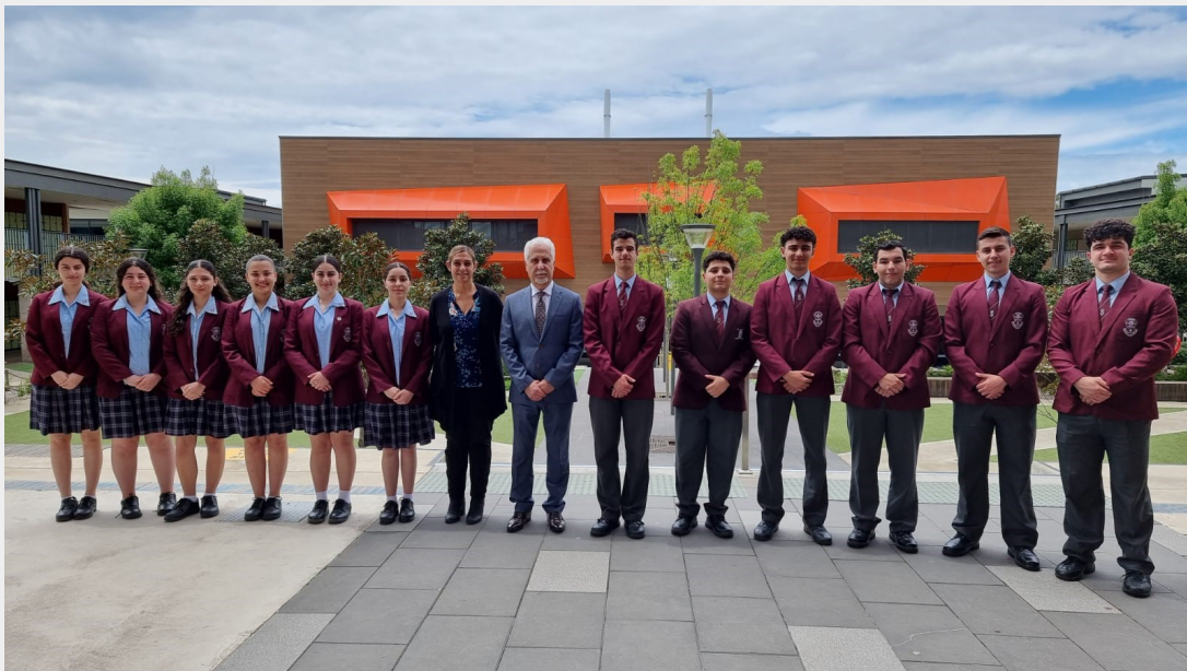
2023 Student Leadership Team

I urge other Year 5 parents to contact our friendly office staff for relevant details so they too can secure a placement for their child at St. Narsai College in the 2024 intake.